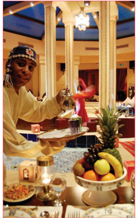
◆ Savour the enigmatic and alluring flavours of Morocco at the Novotel Al Dana Resort's Al Yacout restaurant

Whether it's dine-in, take away or home delivery, taste the difference at Charcoal Grill. Contact 17213860, 17213410 or 17223531 for more information. *