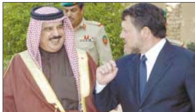
His Majesty King Hamad arrived in Amman yesterday and was welcomed on arrival by the Jordanian monarch, King Abdullah, and other officials.