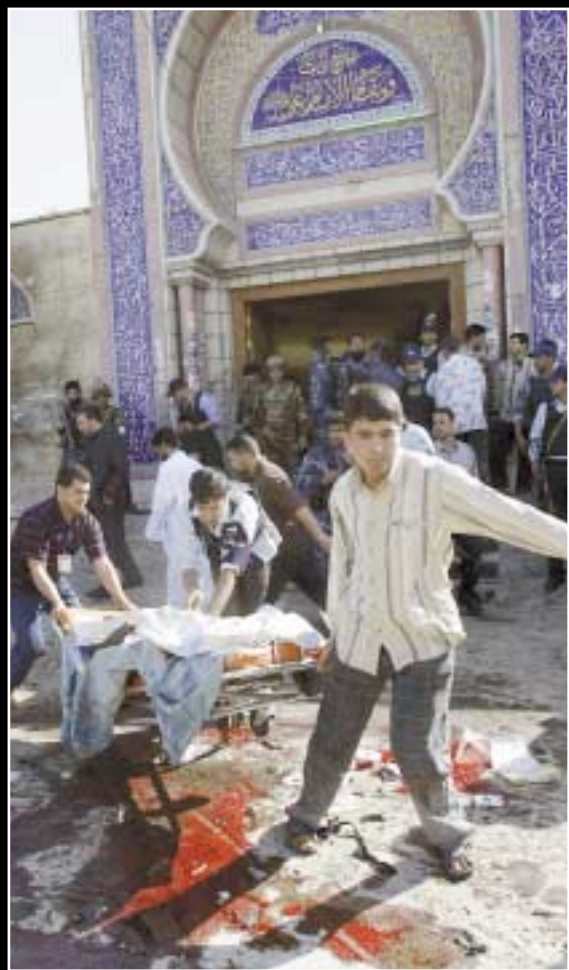
Iraqis evacuate a dead worshipper outside the Baratha mosque