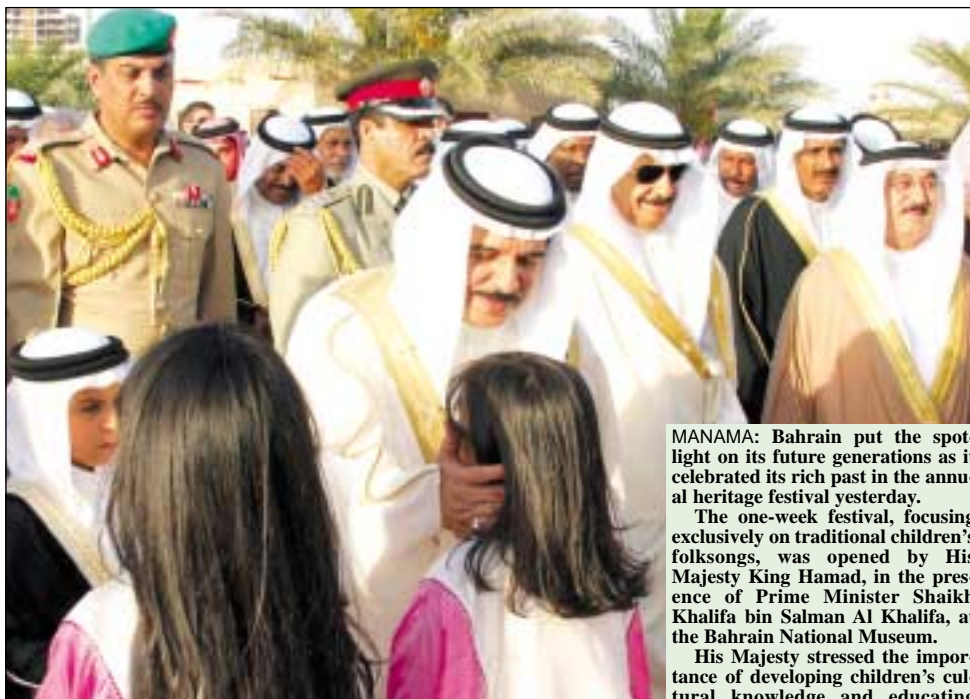
■ His Majesty and the Premier are welcomed by young girls at the opening ceremony

As the seven were taken away in handcuffs yesterday, protesters began shouting and chatting as police stood by, but there was no trouble.