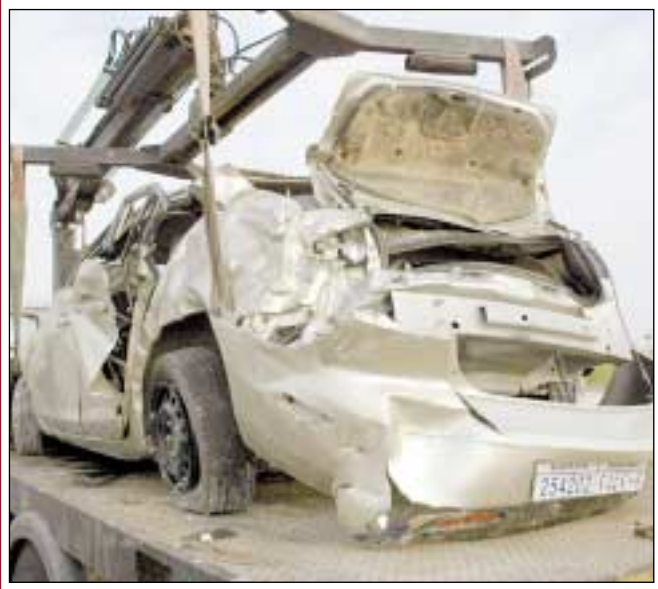
■ The damaged car at the scene of the fatal accident.

NABLUS: Eight Palestinians were wounded and four arrested during an Israeli army incursion into a refugee camp in the northern West Bank yesterday. Palestinian witnesses and security sources said a house was also destroyed in the raid.