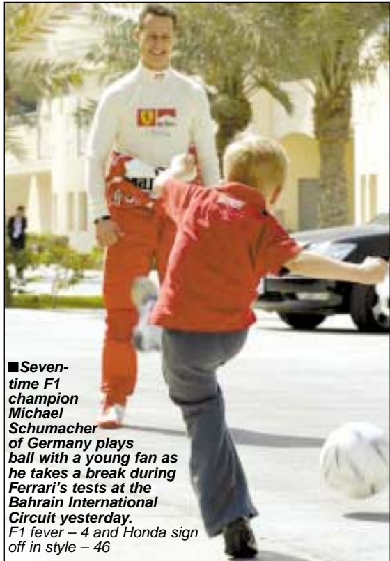
■ Seven-time F1 champion Michael Schumacher of Germany plays ball with a young fan as he takes a break during Ferrari's tests at the Bahrain International Circuit yesterday. F1 fever - 4 and Honda sign off in style - 46

ISLAMABAD: Pakistan last night said it had lodged a protest with New Delhi after an Indian aircraft allegedly violated its airspace over the Arabian Sea.