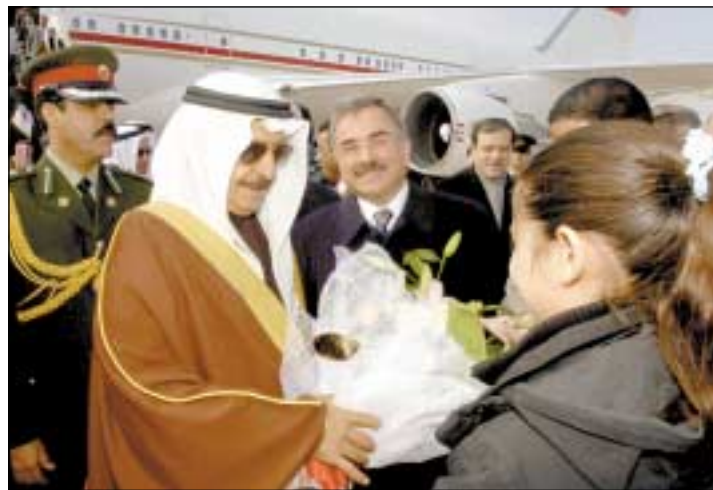
The Premier is welcomed on arrival in Istanbul where he attended a signing ceremony to set up a Bahrain-Turkish Economic Council

He urged businessmen to profit from the Turkish know-how through industrial and economic joint ventures.