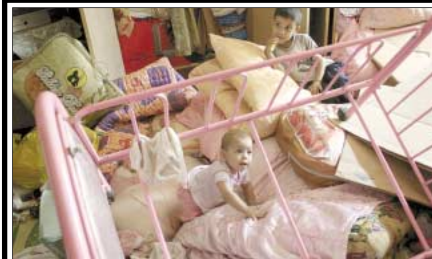
Iraqi children rest on mattresses amid the mess in a room after US and Iraqi soldiers searched the house during a raid in Sadr City yesterday. The joint forces raided the bastion of Shi'ite cleric Moqtada Al Sadr hours before the US military issued a statement welcoming his order to freeze his militia.